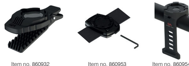
Item no. 860932