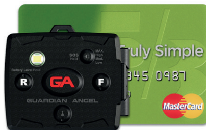
Item no. 860987